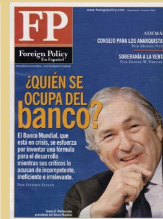
FP Colombia Bound insert appears bimonthly in Colombia's weekly magazine, Cambio . In Spanish, featuring articles translated from FP .