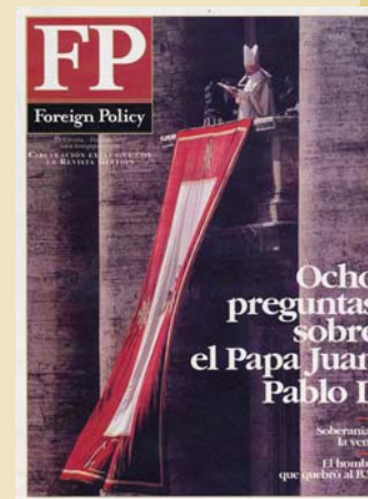
FP Ecuador Bound insert appears in every issue of Ecuador's monthly magazine, Gestión . In Spanish, featuring articles translated from FP .