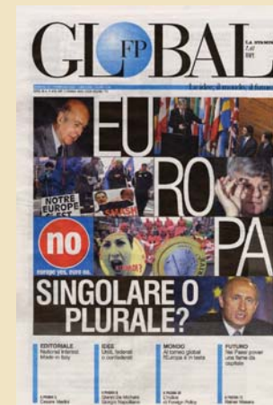
FP Global Stand-alone edition published bimonthly by the Italian newspaper, La Stampa . In Italian, featuring articles translated from FP , plus regional content.