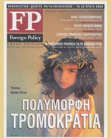
FP Greece Stand-alone edition published bimonthly by Greece's International Centre of Education and Research. In Greek, featuring articles translated from FP , plus regional content.