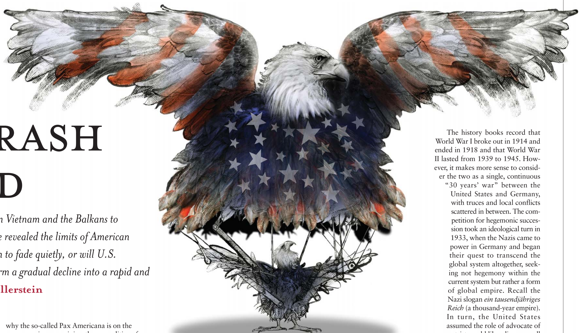
ILLUSTRATIONS FOR FP BY HORACIO CARDO

The rise of the United States to global hegemony was a long process that began in earnest with the world recession of 1873. At that time, the United States and Germany began to acquire an increasing share of global markets, mainly at the