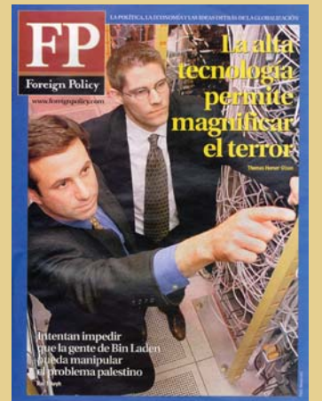
FP Venezuela Bound insert appears monthly in Venezuela's weekly magazine, Primicia . In Spanish, featuring articles translated from FP .