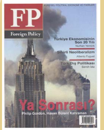
FP Turkey Stand-alone edition published bimonthly by Istanbul's Bilgi University. In Turkish, featuring articles translated from FP , plus regional content.